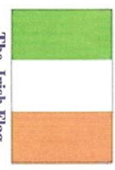
The Irish Flag