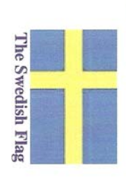
The Swedish Flag